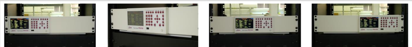
Below depicts the Twin Instrument configuration giving a convenient Six-Phase solution